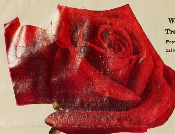
CHRYSLER IMPERIAL: (Pat. 1167) A very dark red, of good size. $2.50 each.